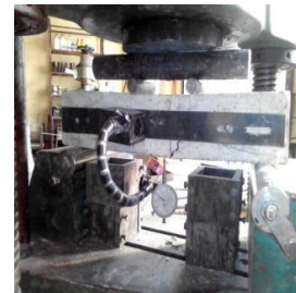
Fig: 2 Flexural strength