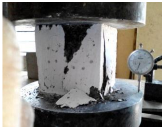
Fig: 1 Compression testing

as shown in figure 2. Dial gage was attached to the neutral axis of beam to get accurate deflection at the rate of maximum load test setup as suggested by (P.N.Balguru 2000) as shown in figure 2. A calibrated stiff UTM with capacity of 600kN was used for testing of the flexure specimens and load was applied at the rate of 400kg/minute for 150mm size of beam as per I.S. (I.S.516-1959). During testing the deflection was monitored with the help of dial gage apart from the ram-displacement obtained from the machine. The standard test method is based on determining amount of energy required to deflect the beam.