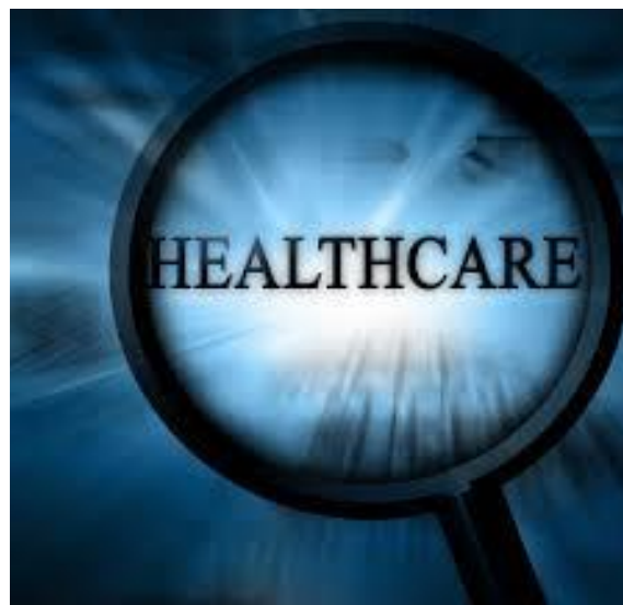
Fig 0: Focus on healthcare

In created nations like India, medicinal services is conveyed through open segment and private part. General society medicinal services framework comprises of human services offices keep running by focal and state government which give administrations costless or at a sponsored rates to low salary aggregate in country and urban territories.