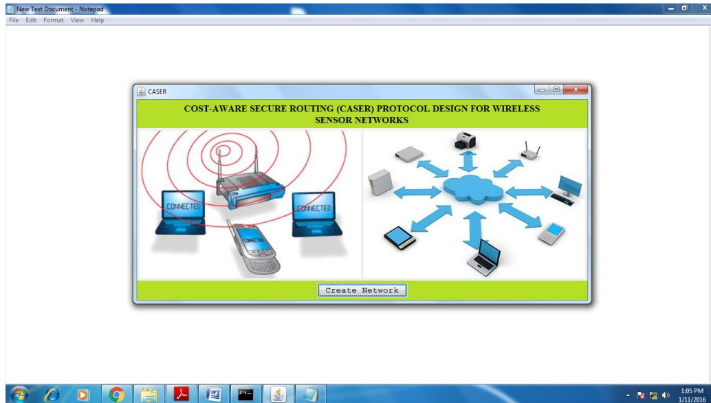
Fig 2. WELCOME SCREEN