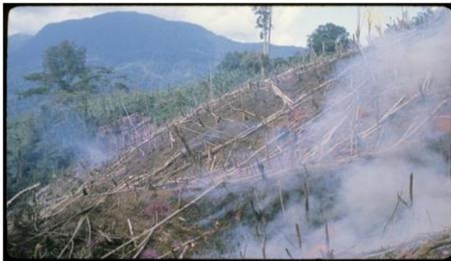
Fig.2.Slash and burn

Cultivation or agribusiness is the foundation of the Indian economy, as two-thirds of the occupants live in rural areas and are dependent (specifically or in a roundabout way) on cultivation as a profession. The farming communities in India are facing multiple problems to increase their agriculture productivity. In spite of fruitful researches on new farming practices regarding crop cultivation, a majority of the farmers are not getting high and ensured yield because of various reasons.