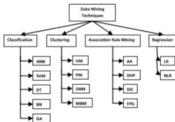
Fig.1.Data Mining Strategies

In the late research world, Data mining is an extremely critical space to study. The strategies are helpful to extract critical and perfect information which can be comprehended by numerous people.