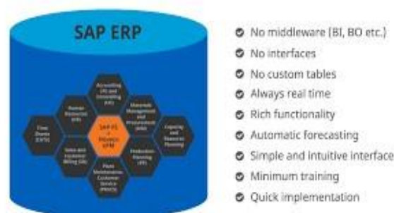
Fig.1.SAP as ERP

With the awake of Globalization, Indian Automotive component manufacturing industry got enormous growth opportunity, but at the same time it started facing newer challenges of the new era. The prevailing pricing due to the buyer's market arising out of the steep competition shrunk the profit margins drastically. The Industry realized that it will not be any more profitable to do a business in the same manner, they were doing in past. While, automotive market was growing very